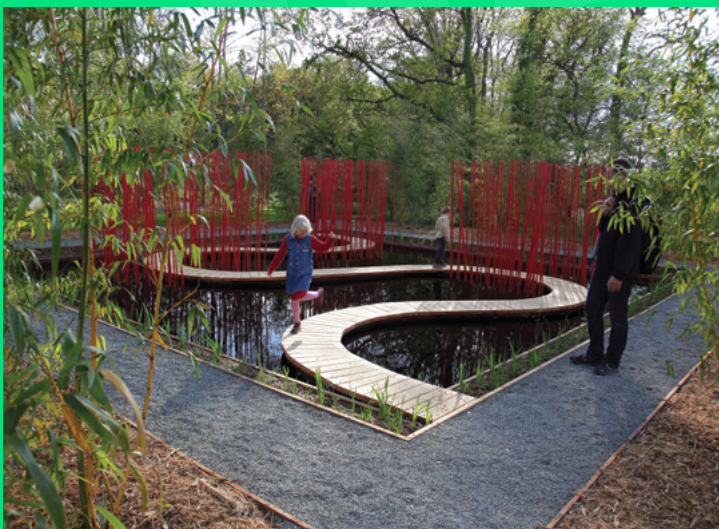
Kongjian Yu – Turenscape, China

Inclusions: Travel from MCEC to demonstration sites and return, morning tea and lunch.